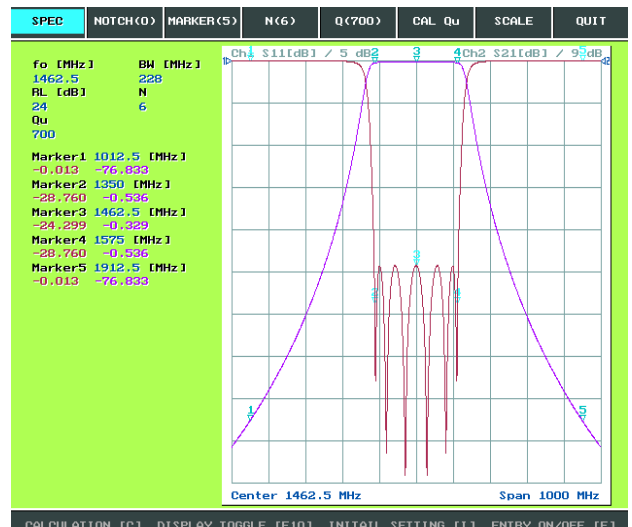
[ SIMULATION GRAPH ]